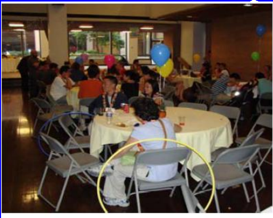
Winter Bash, 2009