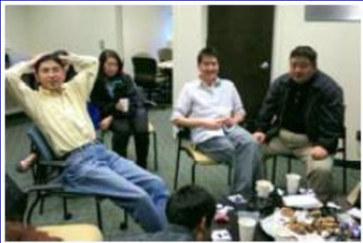
Postdocs using “the Lounge”