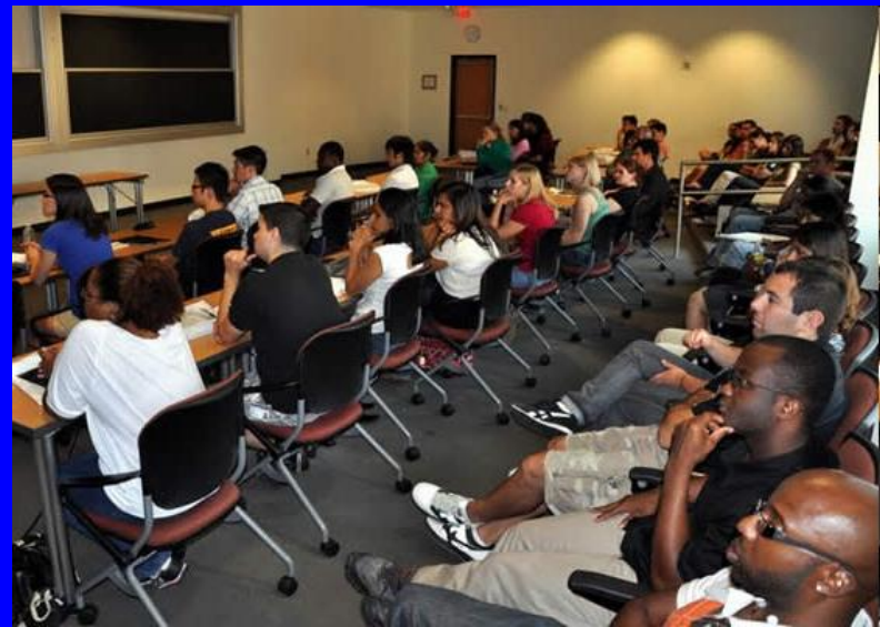
Pictures from GSA-run Fall student orientations, 2009, Thomas Jefferson University