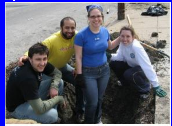
Tree Planting, 2009